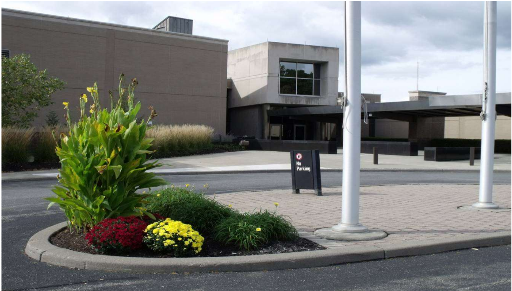
MetLife Project – Attachment #6