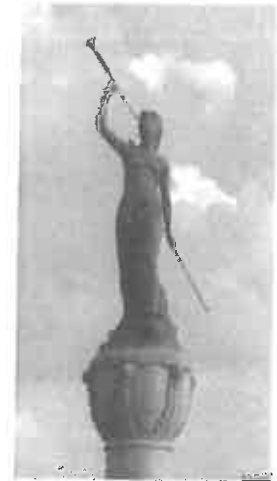
A Call To Arms

The Rensselaer County Historical Society enriches the present and advocates for the future by bringing the region's past to life, recognizing every face and every story.